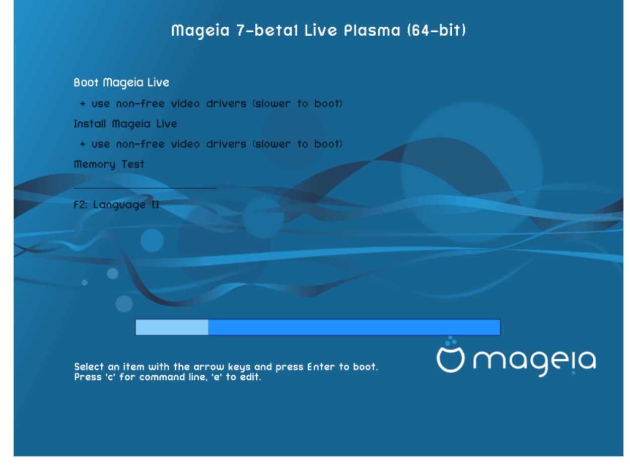
First screen while booting in BIOS mode