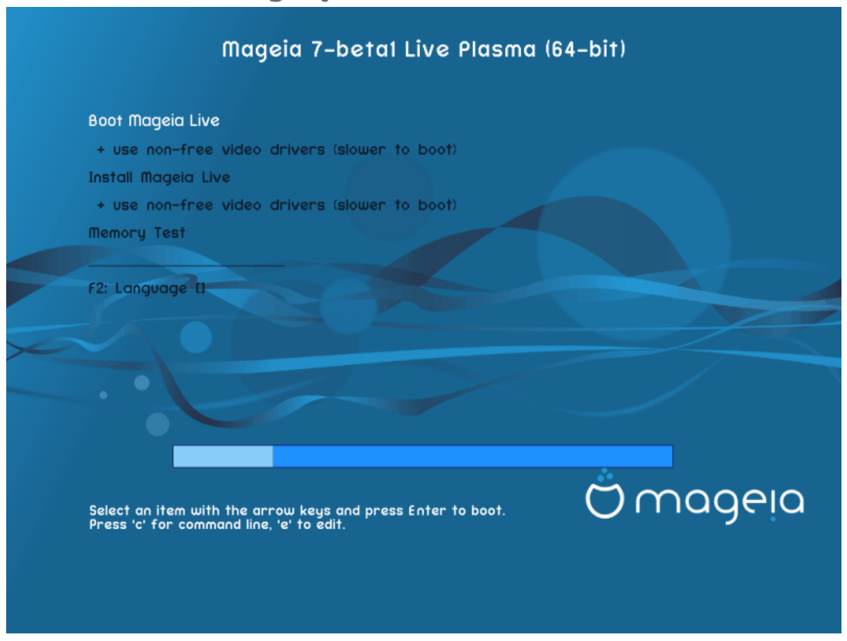
First screen while booting in BIOS mode