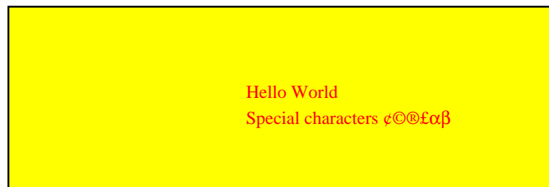
Figure 11-1: 'Hello World'

This will produce a PDF file containing the following graphic: